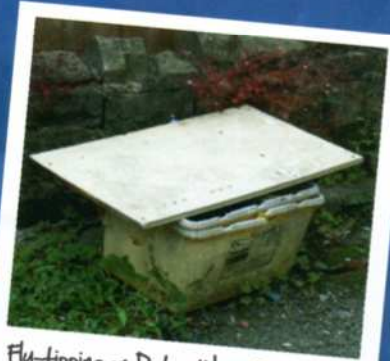
Fly-tipping on Peter Way, Somercotes