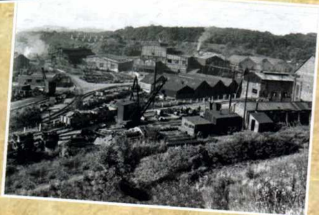
Ironworks Pye Bridge

Light refreshments are available on the day at a reasonable charge.