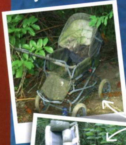
Recent Fly-tipping on the path behind Pennytown Court

Fly-tipping is unsightly, is a nuisance to residents, is harmful and expensive to clean up and it is illegal. So never dump rubbish/waste anywhere other than an official site. In addition those who dump hazardous asbestos waste create a health hazard too.