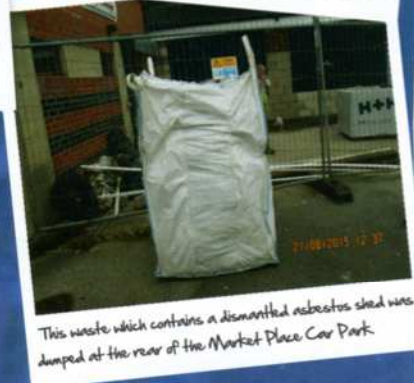
This waste which contains a dismantled asbestos shed was dumped at the rear of the Market Place Car Park

Somercotes Parish Council Waste Disposal Facility is provided on the first Saturday in every month between 8am and 10am.